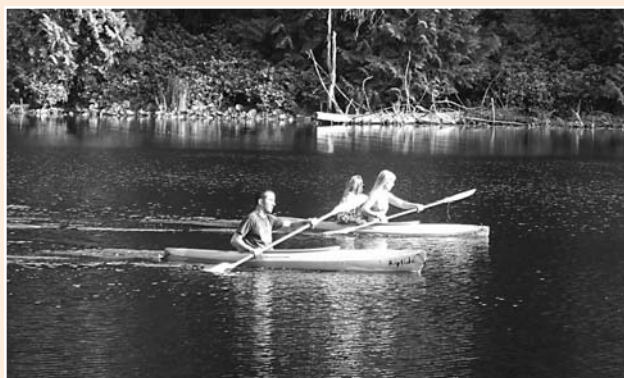
Explore the islands on the water for stunning views and a chance to spot bald eagles, herons, harbour seals and more.