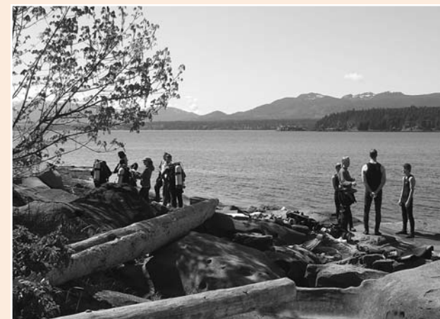
Explore the islands' shorelines, above and below the surface.

We invite you to help us steward this wonderful but fragile place. If we all slow down, conserve water and be respectful of our footprint, the Island will nourish us for years to come. We also invite you to come back in the spring, fall or winter to fully experience the peace, beauty and character of the Island. There is much to enjoy: the Blues Festival, the